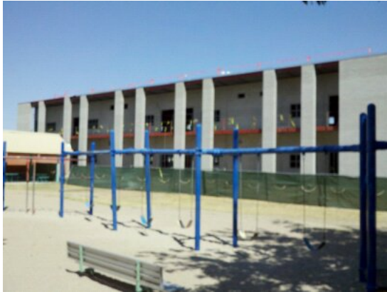
New Two Story Classroom Building