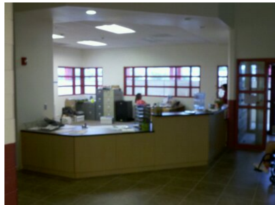
New Admin Reception