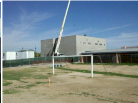
New Two Story Classroom Building and New ADA Ramps to Playground

C. Walker Elementary Classroom Addition: Construction is 62% complete. The new two story classroom exterior walls, second floor deck, and roof deck are complete. Roofing is being installed. Interior framing, mechanical, electrical, and plumbing work is ongoing. As reported last month, the new kitchen and MPR remodel is complete and in use. The new fire alarm and new IT re-cabling systems are installed and operational. Walker is on schedule and on budget.