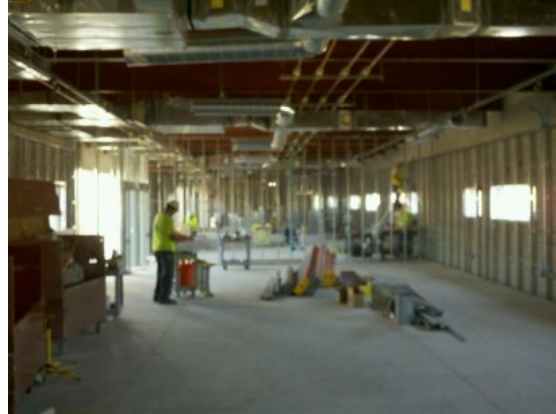
Interior Framing and MPE Installation