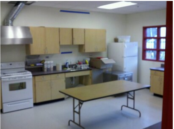
New Life Skills Room