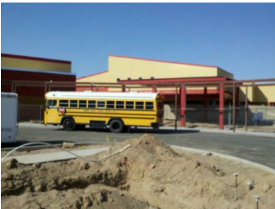
Front Entrance with New Bus Drop Zone