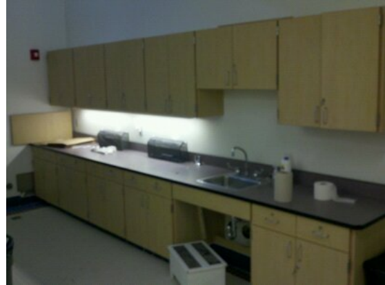
New Classroom Restroom

B. Nash Elementary Classroom Addition: Construction is 52% complete. The new two story classroom building exterior walls, second floor deck, and roof framing are complete. Roof decking is being installed. The playground resurfacing and ADA accessible walkways are complete and in use. The new fire alarm and new IT re-cabling systems are installed and operational. Nash is on schedule and on budget.