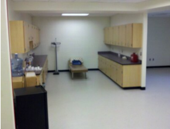
New Health Office